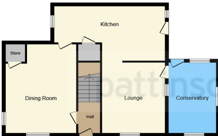
Ground Floor Floor area 80.3 m 2 (865 sq.ft.)