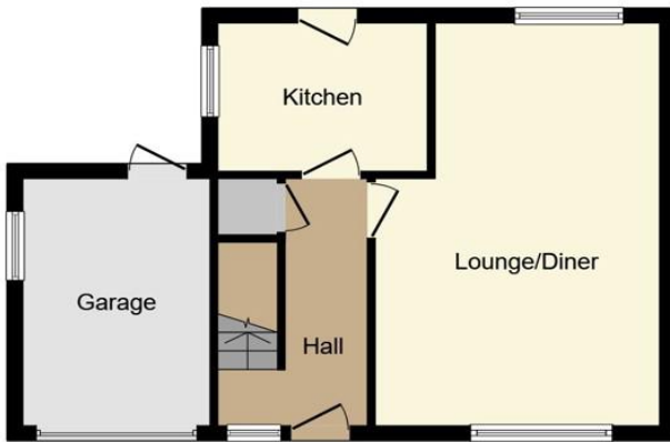
Ground Floor Floor area 42.7 m 2 (460 sq.ft.)