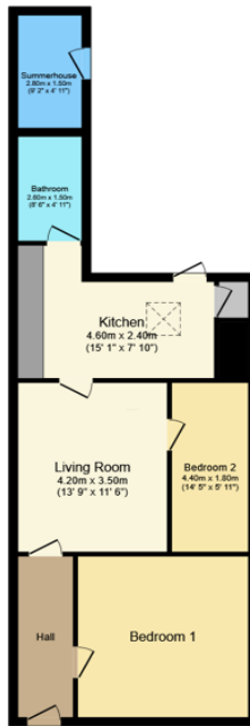
Floor Plan Floor area 68.2 sq.m. (734 sq.ft.)

Total floor area: 68.2 sq.m. (734 sq.ft.)