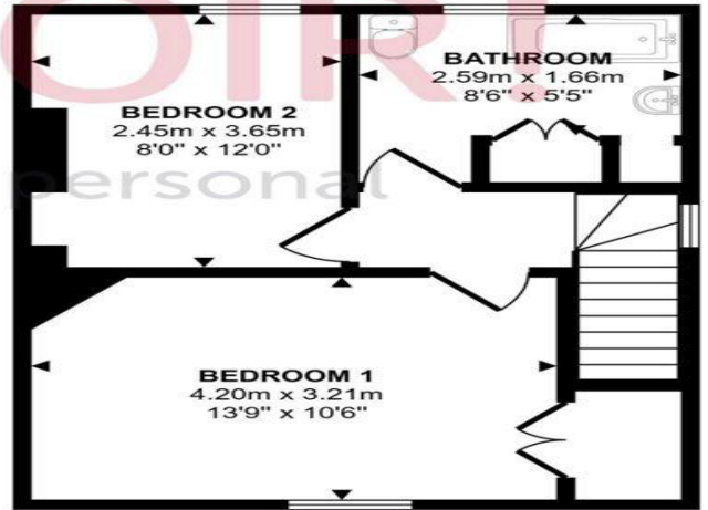
First Floor Approx 36 sq m / 389 sq ft

This floorplan is only for illustrative purposes and is not to scale. Measurements of rooms, doors, windows, and any items are approximate and no responsibility is taken for any error, omission or mis-statement. Icons of items such as bathroom suites are representations only and may not look like the real items. Made with Made Snappy 360.